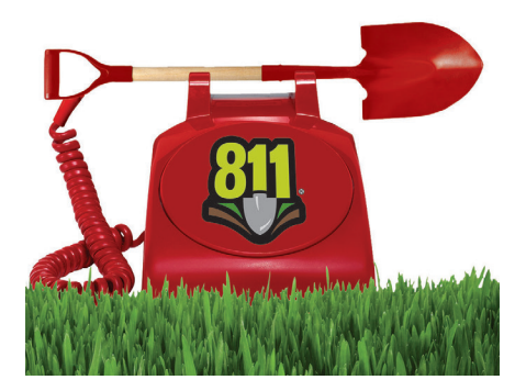
Call 811 before you dig www.call811.com

City of Virginia Department of Public Utilities (VDPU) is based in Virginia, Minnesota and operates the city's natural gas distribution system. The system includes about 62 miles of natural gas distribution pipeline servicing approximately 3400 customers. The pipeline is serviced from two Town Border Stations. One is located on Highway 7 in Mountain Iron and the other is located along Hwy 37 near Station 44 Rd. The maximum operating pressure is 50 psi.